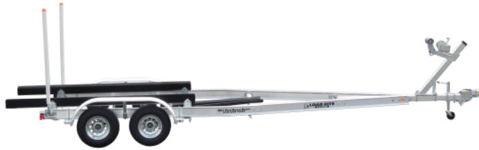
Image of Model #5S-AC25T6000102LTB1. Options and features may differ.