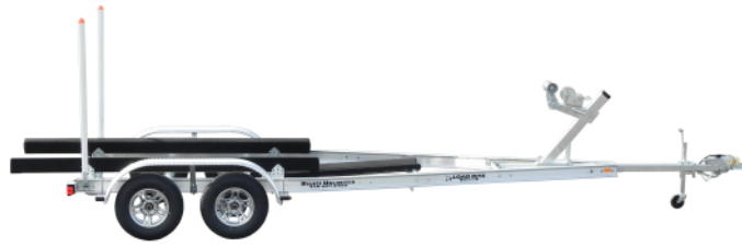
Image of Model #5S-AC23T5200102LTB1. Options and features may differ.